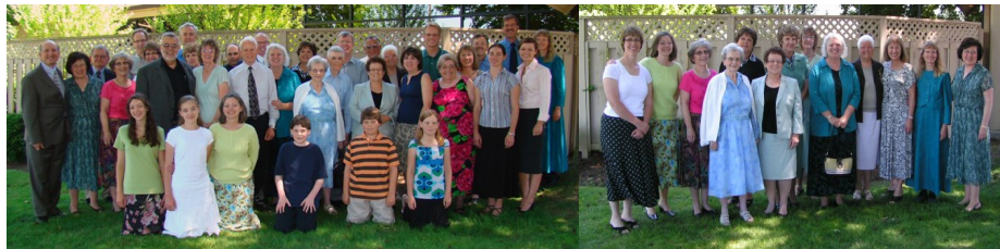
Doctors and family