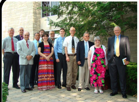
ASDAO members in Chicago