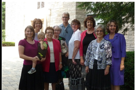
ASDAO auxiliary in Chicago