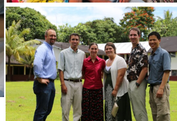
Pohnpei Mission Trip Pictures