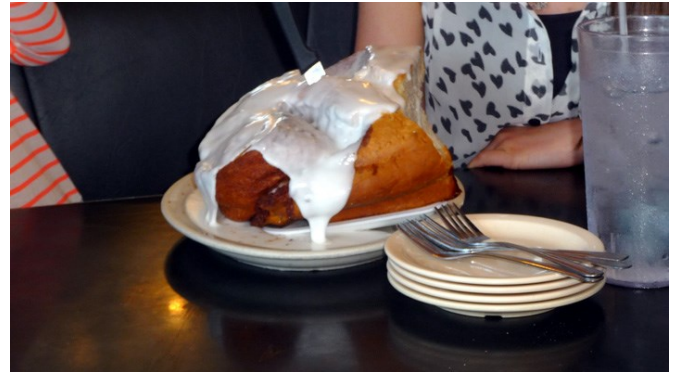
THIS 3 POUND CONNAMPN ROLL AVABLE AT Lulu's bakery and Café 718 N. MAIN