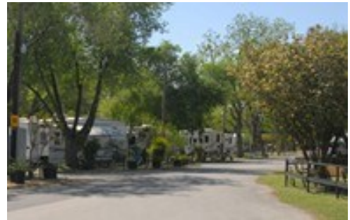
Cabins also available