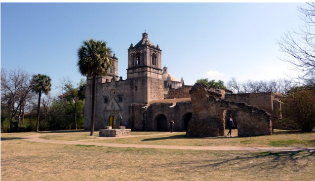
SERVAL MISSIONS ARE THERE TO VISIT