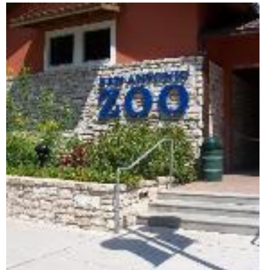
SAN ANTONIO ZOO

Many other places of interest to see. Check them out on the internet